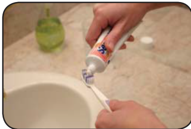
Use desensitizing toothpaste