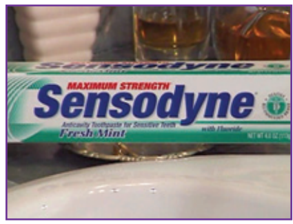
Use desensitizing toothpaste